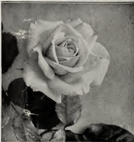
Famous Jeannette Heller Rose

WHITE KILLARNEY— Glistening white. Buds long and flowers immense in size.